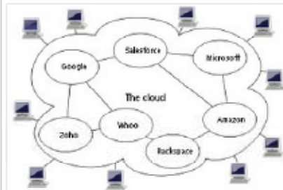
Cloud Computing gets big Latin American leader legup

Latin America has traditionally been seen by the rest of the world to be behind when it comes to information technology. However, a recent announcement from Cisco stated that the company is hoping to form new partnerships within the region, which will boost the